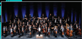
THE WINNIPEG SYMPHONY ORCHESTRA

Adults $30 / Seniors $25 / Under 30 $15 Tickets at McNally Robinson Booksellers or by calling 204-896-PHIL(7445)